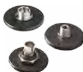
Fiber Adaptors & Connectors (FC, ST or SMA)