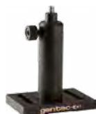
Stand with Delrin Post (Model Number: 200428)