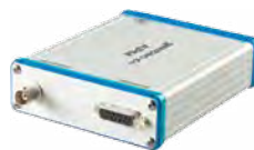
APM Analog Power Supply (Model Number: 201848)