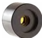
PE5B-Ge (5 mm - Germanium)