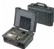
Pelican Carrying Case