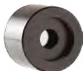
PE3B-Si (3 mm - UV-Silicon)