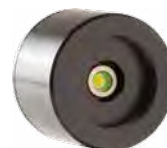
PE3B-In (3 mm - InGaAs)