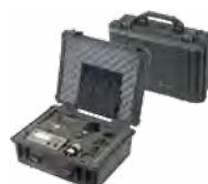
Pelican Carrying Case